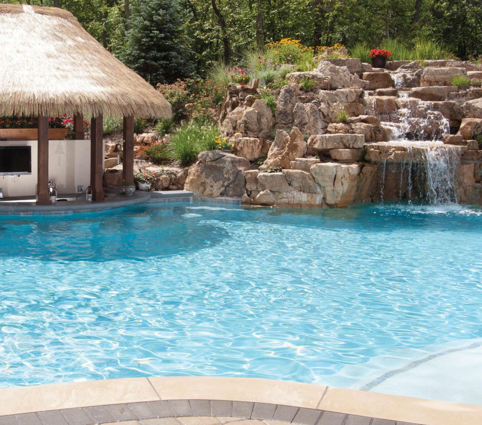
Krystalkrete Super Blue